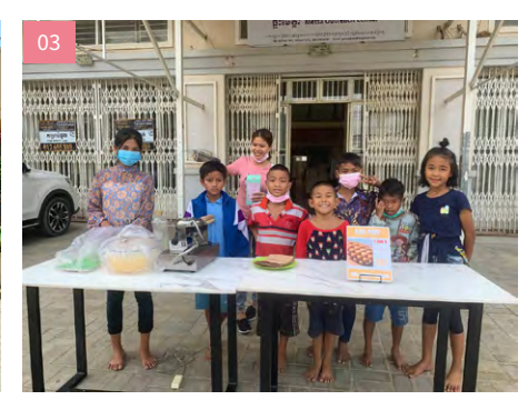
3 / 孩子在週末體驗售賣小食。 Our kids sold snacks at the weekend.