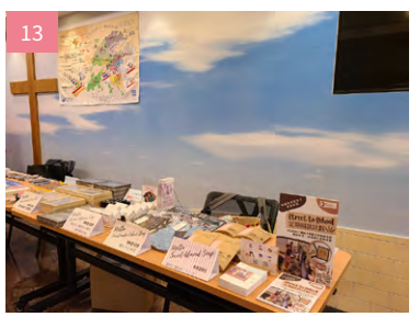
13 / 感恩可以於中國基督教播道會失福堂宣教雙週擺放義賣攤位。We are grateful to have a charity sale counter at EFCC Tsim Fook Church.