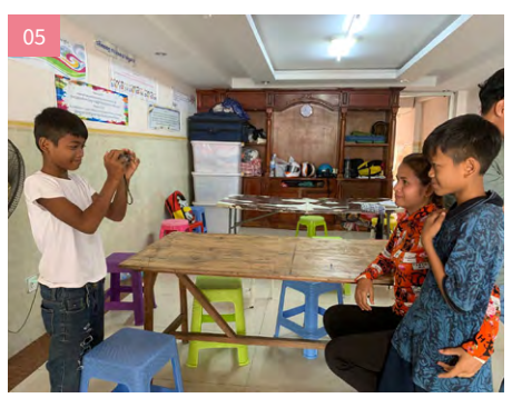
05 / 小朋友第一次上攝影堂,感到很新奇有趣。 It was the children's first photography lesson, and they found it very interesting.