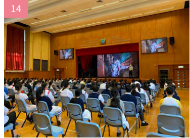
14 / 疫情漸趨穩定,我們又可以到學校分享柬埔寨貧窮孩子的情況;圖為沙田崇真中學。As the pandemic stabilized, we could share the poverty of the children in Cambodia with the students. The photo was taken at Shatin Tsung Tsin Secondary School.